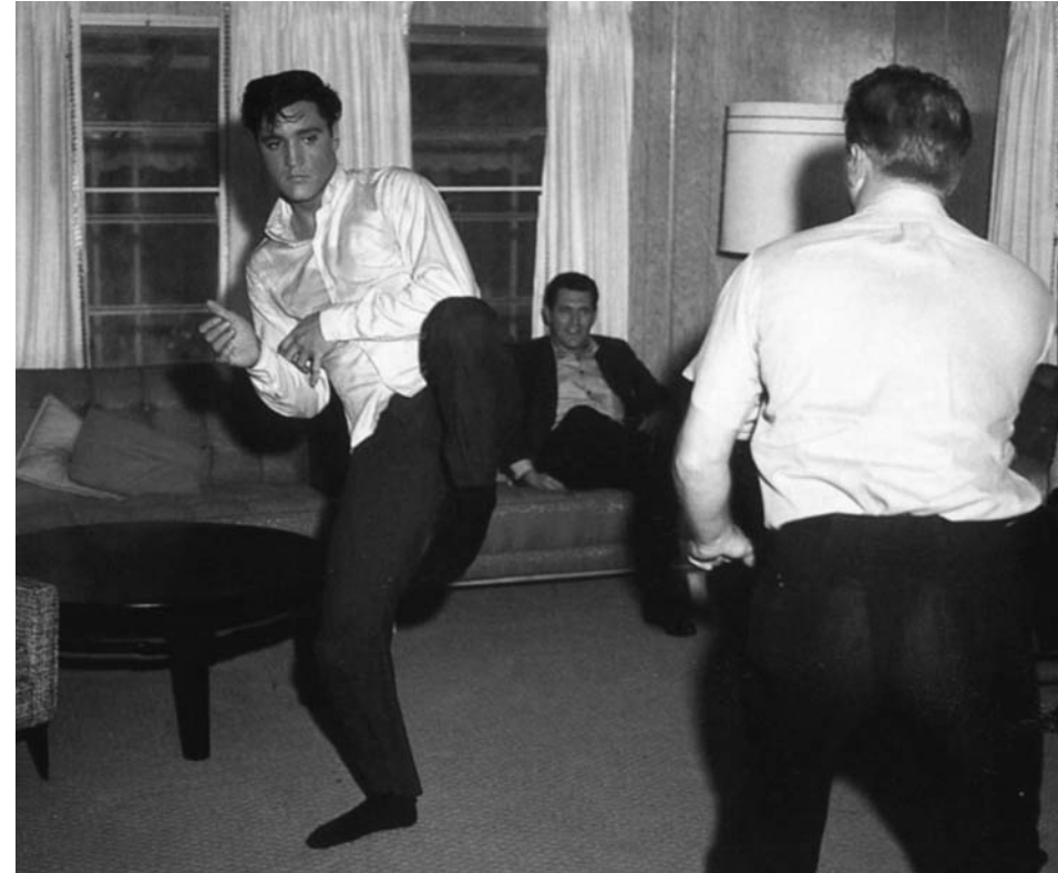
Elvis mostrando suas técnicas no Karatê durante a década de 60

A mídia em geral só teceu elogios a Elvis como o jornal "New York Times" de 10 de junho de 1972. Já naquela época o Rei era um veterano, além de ser um mito ainda em vida. A revista "Rolling Stone" disse a seguinte frase sobre o disco gravado no Madison "...deste disco você gostará queira ou não" . Realmente o disco trazia de tudo um pouco e atrapalhou os DJs nas rádios, pois o LP não havia divisão das faixas. A RCA se viu obrigada a editar cópias especiais para as rádios!